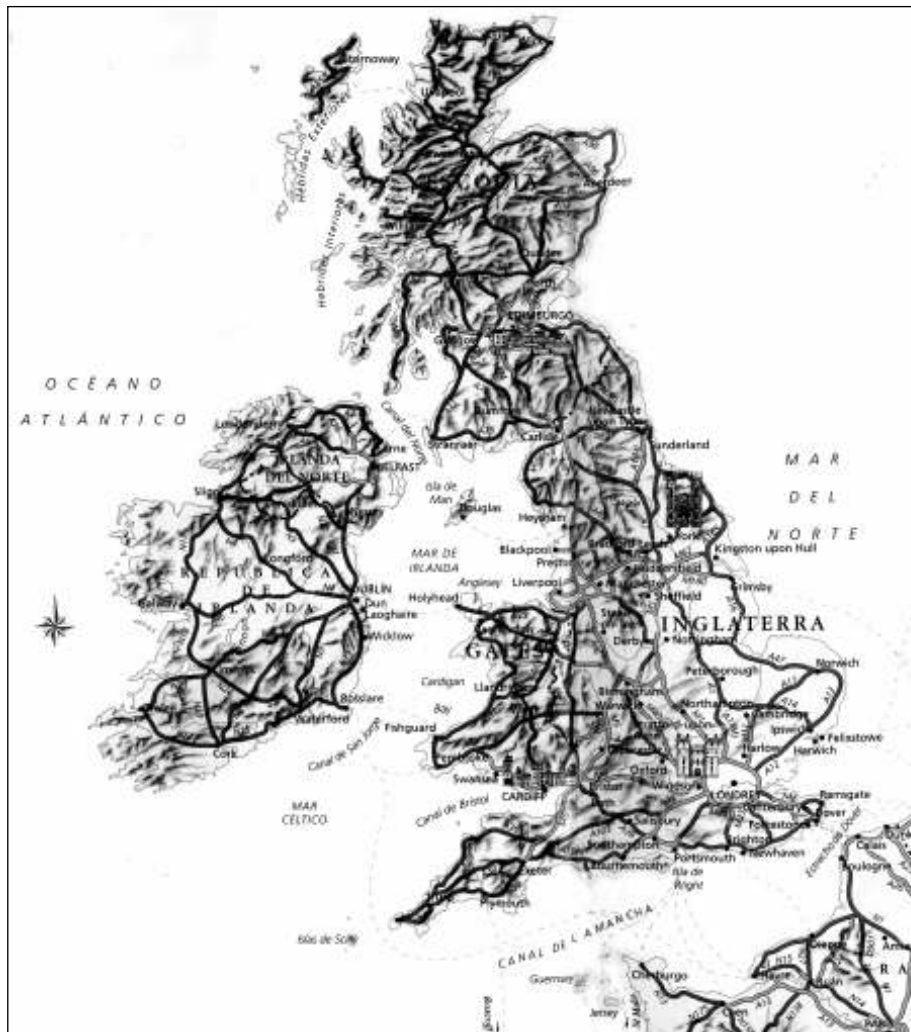
Voyages en Angleterre, Irlande et Écosse 1835

1er Voyage: Londres (I-1); Birmingham (I-13); Chester (I-16); Dublin (I-19); Killamery (II-3), Kiillarney (II-8); Limerick (II-9); Carlow (II-14); Dublin (II-21); Glasgow (III-1); Dumfries (III-7); Carlisle (III-8); Londres (III-21).