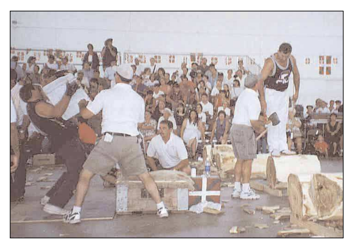
Wood choppers from Euskal Herria performed for the Jai Aldi thousands of cheering crowds.

pala (racketball) and pelota (handball) players that are keeping their love of Basque sport alive. They hold regular fundraisers to help pay for maintenance and expenses. However, many are worried about the continuance of the sport. Despite the encouragement from the crowds, the physical hardship of playing by the Basque rules of no hand protection discourages younger pelota players from learning when they see the mature players' numb and swollen fingers and hands. During the Jai Aldi 2000 festival the NABO Championships were held for men's and women's pala and pelota. The small fronton has very limited space for spectators, but the hundreds who were able to squeeze in for a match delightedly invigorated the players and the rivalries between Basque Centers.