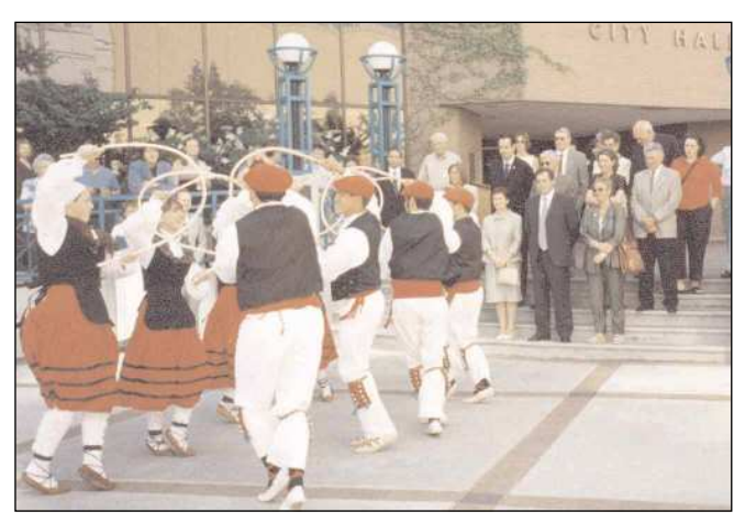
The Oinkari Basque Dancers of Boise Welcomed the officials of the Basque Government and the Gernika City Council.

For seven hours, over 20 performing groups of dancers, musicians, sportsmen, and singers rotated between three different stages while approximately 20,000 family members, friends, and spectators relaxed and enjoyed the entertainment. The aromas of chorizo, solomo, pimientos, lamb, croquetas, as well as hamburgers and hotdogs, tempted most to try the Basque style recipes. These activities were repeated again all day Sunday for many thousands more.