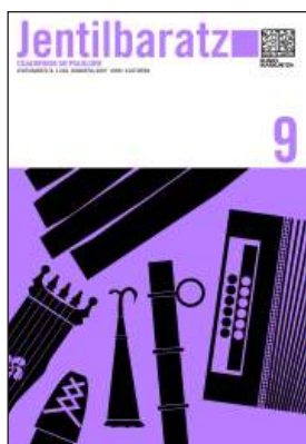
Jentilbaratz. Cuadernos de Folklore, 9. – Donostia : Eusko Ikaskuntza, 2007. – 414 p. : il. ; 24 cm. – ISSN: 1137-859X