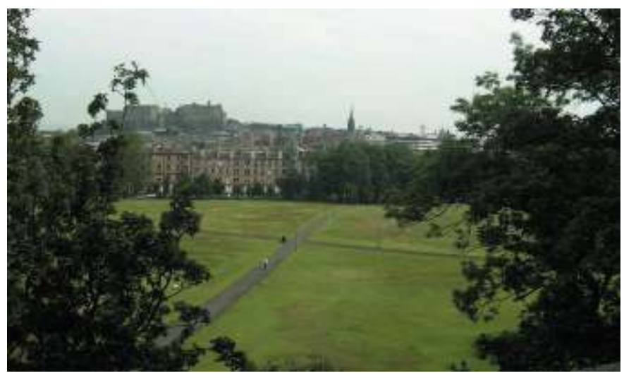
Edinburgh Castle from the University

ism rules. In my view, it seems to be a question of democratic culture and State vision from and old democracy like the one ruling during centuries in Great Britain.